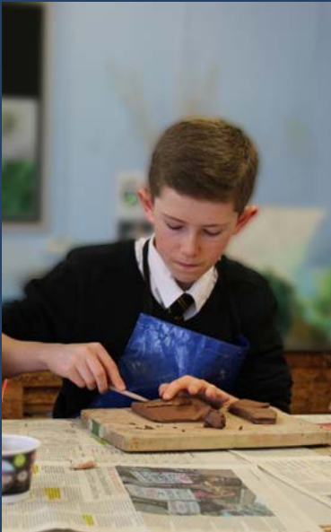
Engaging practical lessons