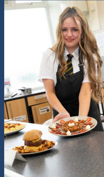
KS3 Master Chef Challenge

'Leaders want pupils to have the highest aspirations. Pupils receive a rich variety of experiences, helping them to prepare for their next steps in education, training or employment.' 'Reading is prioritised' Ofsted (2023)