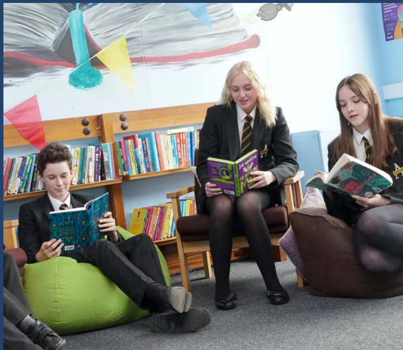
Our recently refurbished library 'The Hub' is the perfect place for students to enjoy reading a new book.

A range of snacks are available during morning break and we have two cafeterias providing a wide choice of meals at lunchtime. It is expected students will remain on site during lunchtime.