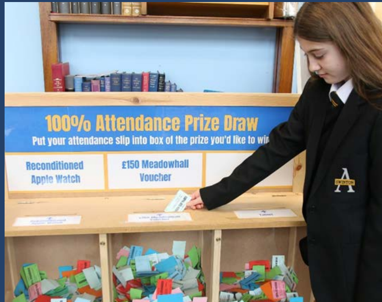
Rewards for 100% attendance to school and to extra curricular clubs