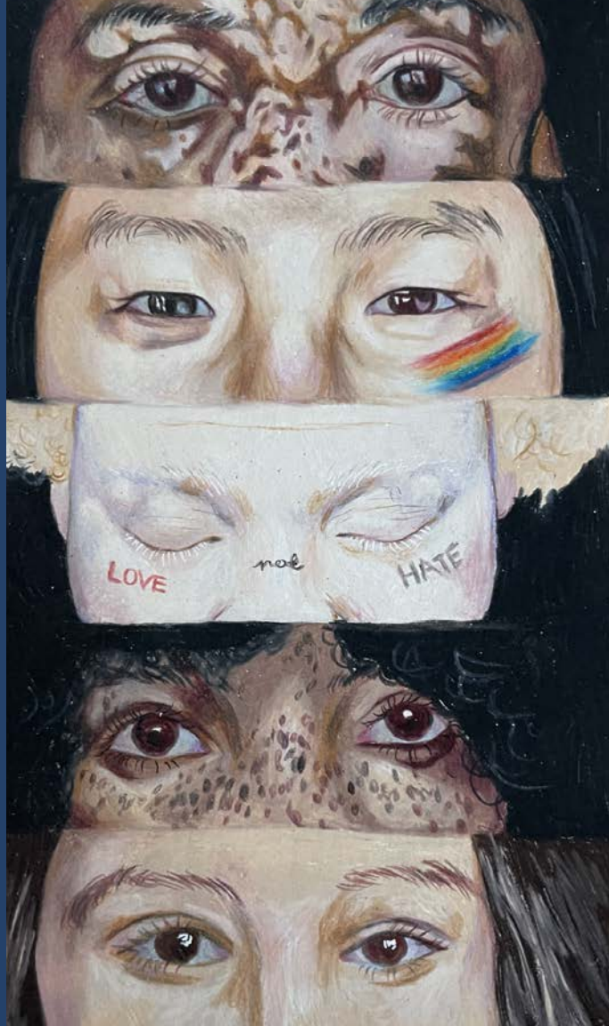
Post 16 student work. Winner of a Rotherham anti-hate crime competition.

Our sports clubs play competitive fixtures/tournaments against other schools during the school week and on Saturdays. All our clubs are a fantastic way to meet new friends, tackle new challenges and unwind, while our academic clubs support learning and progress towards targets. The clubs change every half term so watch out for regular updates on our website, social media pages and on our half termly extra-curricular notice.