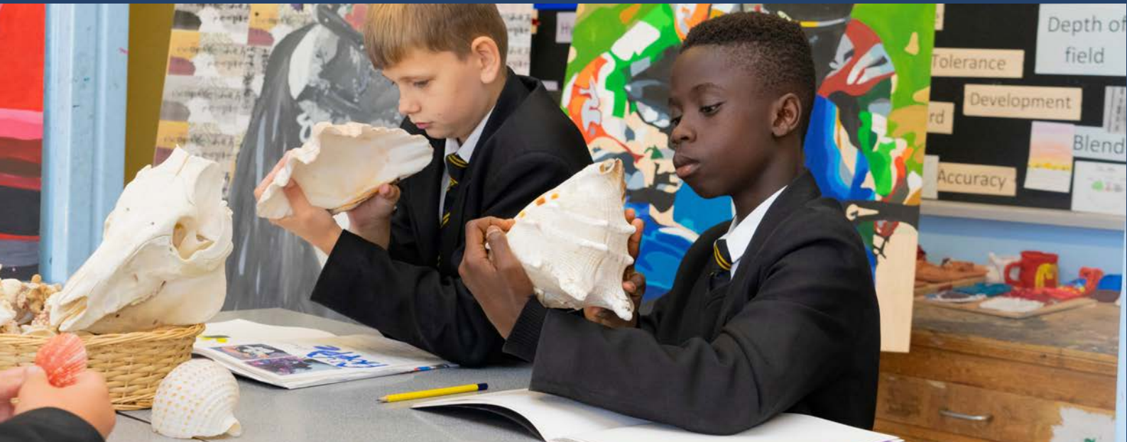
KS3 Art lessons encourage students to explore the world around them.

Swinton Academy is committed to high quality learning and teaching which will provide our students with the essential skills needed to progress effectively in further or higher education, training or employment.